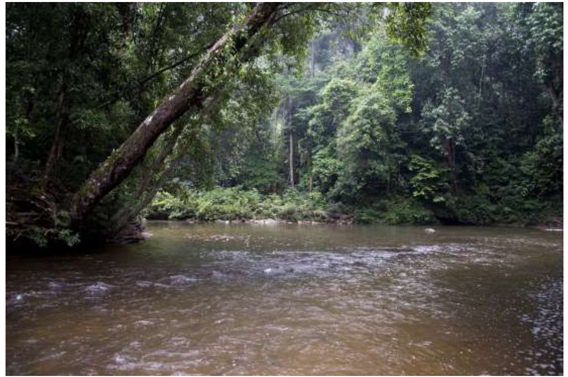
Figure 6. Sungai Tanum, view of habitat downstream from sighting location.

It should be noted that Sungai Tanum and Sungai Relau both support a sanctuary (i.e. a release area) for captive-raised Tor tambroides or 'Mahseer': this fish species is locally known as Kelah . For many years recreational fishing was allowed within Taman Negara, to the detriment of fish stocks: this was banned some years ago and a reintroduction program was started for Kelah , which is still ongoing. Although the large numbers of fish in the area may have attracted the otters, no interactions between the otters and Kelah were observed.