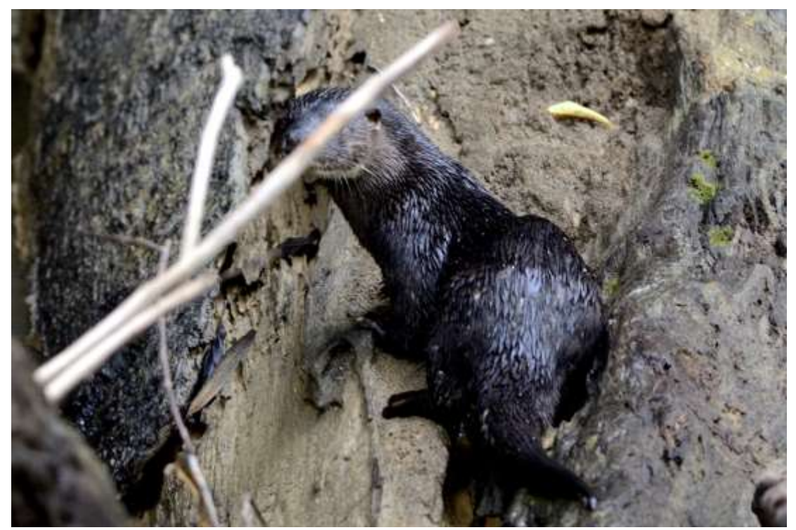
Figure 4. Partly obscured view of L. sumatrana at Sungai Relau showing white upper and lower lips.