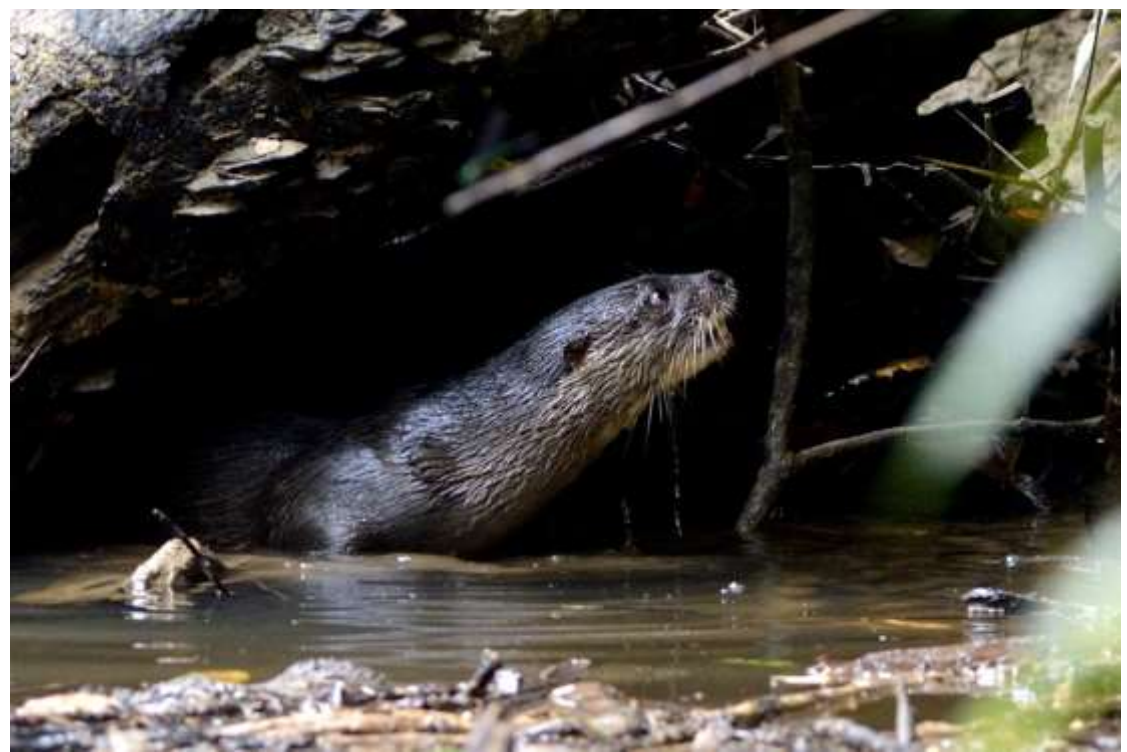
Figure 2. L. sumatrana at Sungai Tanum inspecting area beneath fallen tree.