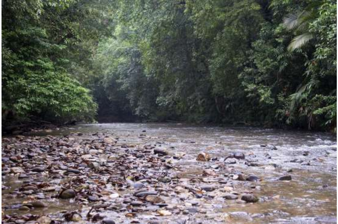
Figure 5. Sungai Tanum, view of habitat upstream from sighting location.