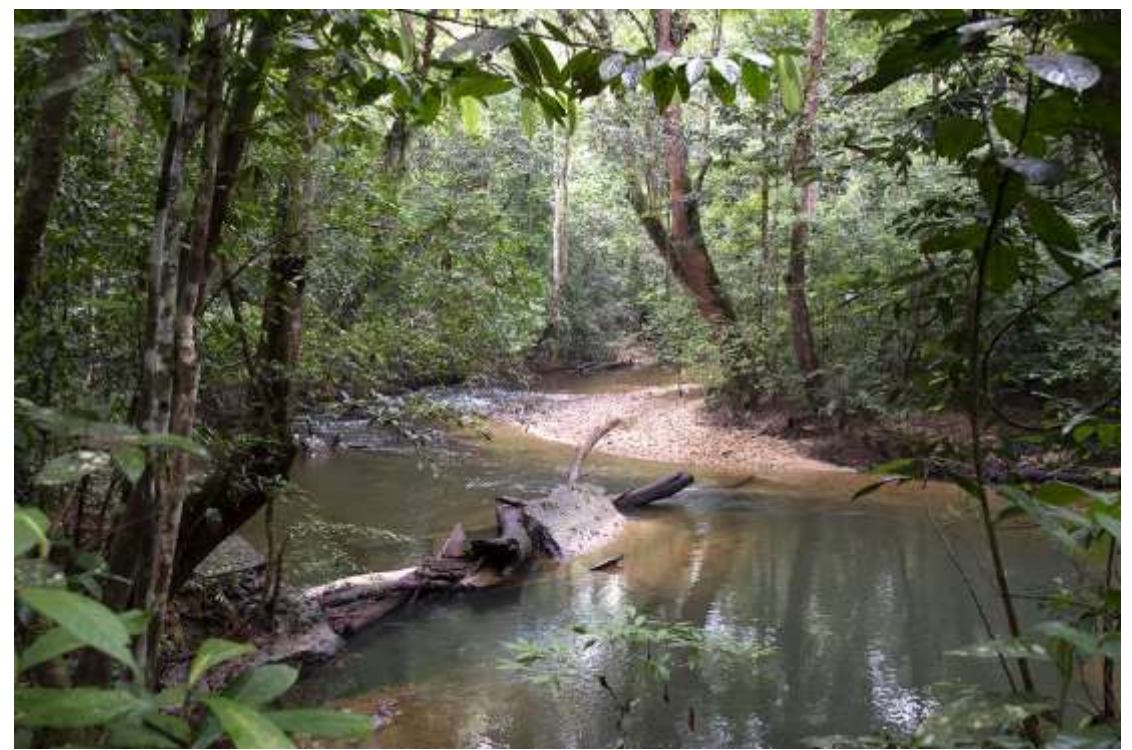
Figure 7. Sungai Relau, view of habitat upstream from sighting location.

These two sightings are 9 km apart but are in separate parts of the river system, and are separated by two divides. The confluence of Sungai Tanum and Sungai Relau lies around 11 km south of Merapoh, thus the 'along-river' distance between the two sightings is at least 20 km via the confluence, probably more when the twists and turns of these two rivers are accounted for. It seems therefore likely that two separate otters were seen.