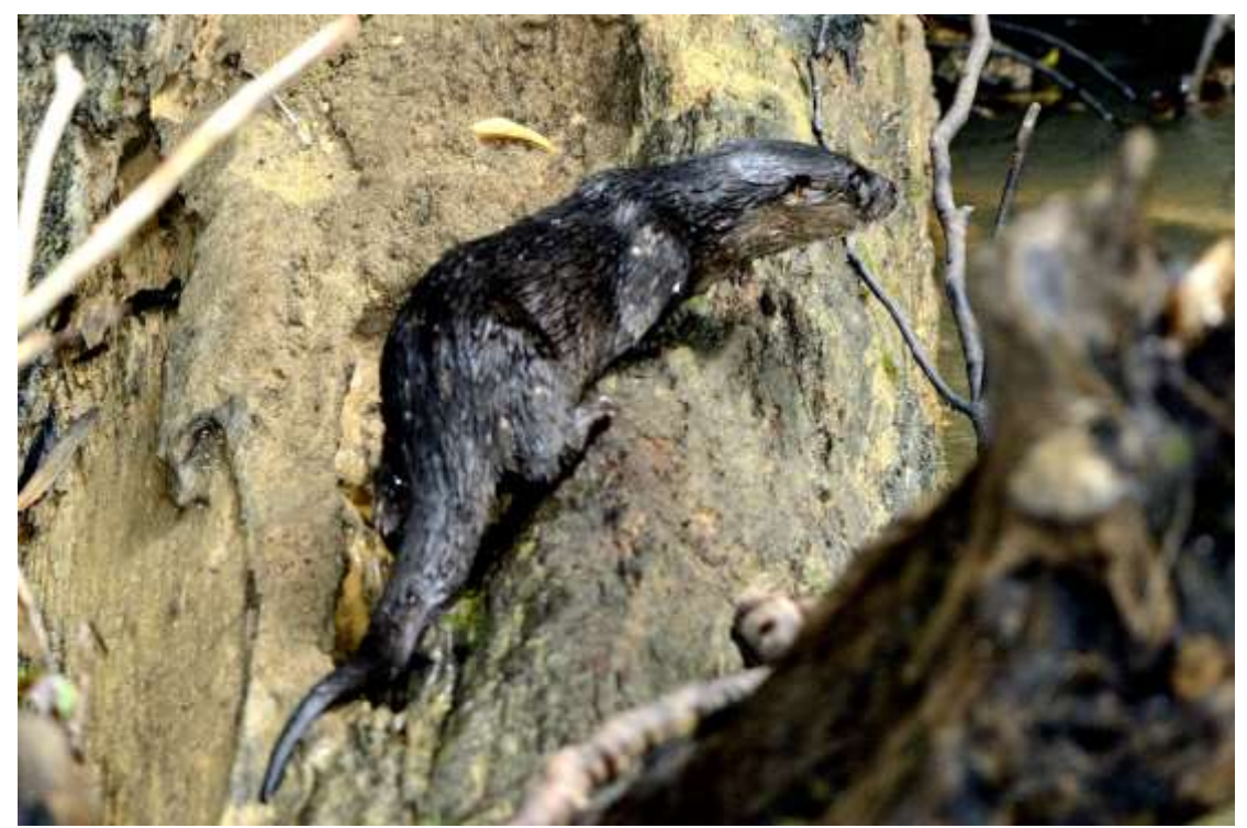
Figure 3. Rear view of L. sumatrana at Sungai Relau.

be limited and human activity is mainly nature appreciation with some swimming activity.