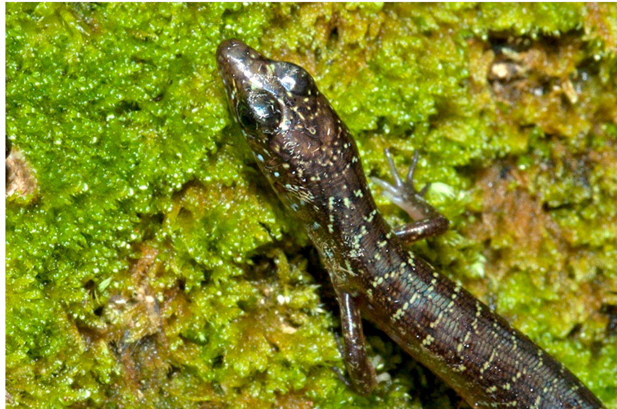
Fig. 2.

Remarks : The subject is identified as Sphenomorphus sp. based on its elongated head and body, and slender limbs, and as a juvenile specimen of Sphenomorphus maindroni based on its brown dorsum and tail bearing numerous thin, wavy, broken, yellowish bars or rows of spots (de Rooij, 1916, as Lygosoma maindroni ). Sphenomorphus maindroni is a species complex which, as of 2004, comprised 22 species (Greer & Shea, 2004).