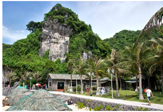
Fig. 1: Cat Ba Beach Resort, view of habitats.