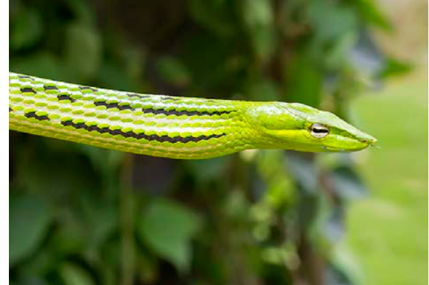
Fig. 8 : Ahaetulla prasina, at edge of resort, view 2.