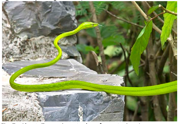
Fig. 7 : Ahaetulla prasina, at edge of resort, view 1.