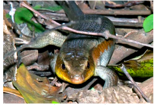
Fig. 6: Eutropis multifasciata, amongst leaf litter.