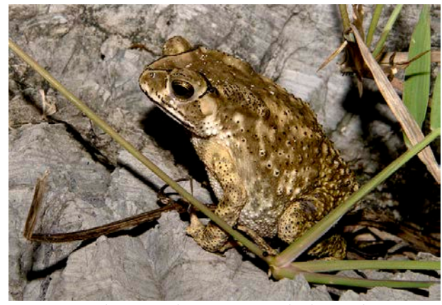
Fig. 2 : Duttaphrynus melanostictus, perched on rock outcrop.