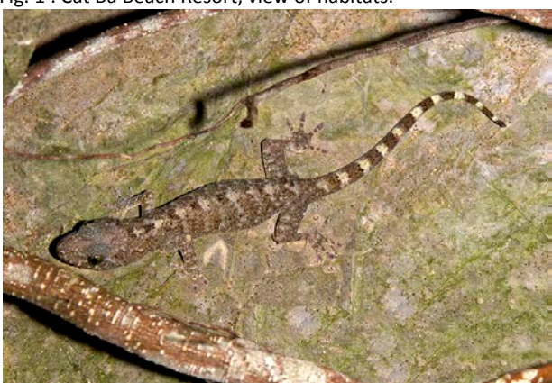
Fig. 3: Gekko palmatus, on rock outcrop.