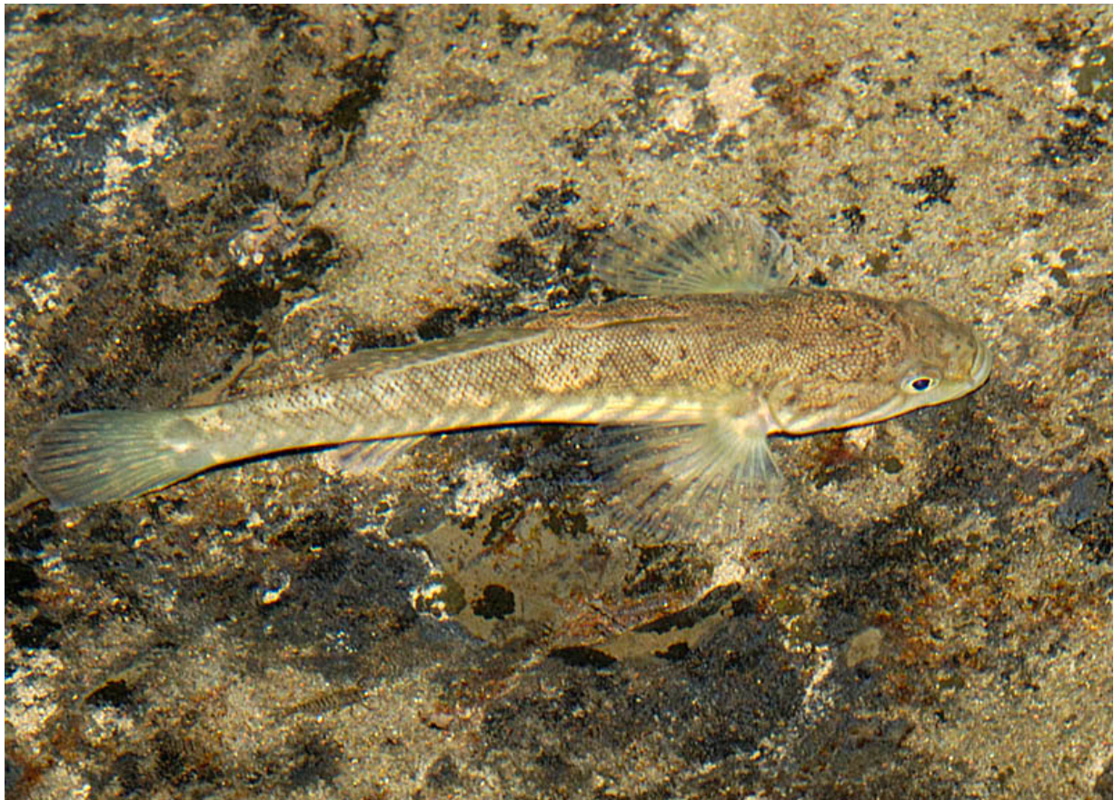
Fig. 1 : Dorso-lateral view of the entire fish, showing the dark chevron markings on the side of the body, dark stripes extending the eye across the cheek, and an ocellus at the tail base.

Description of observation: One specimen, with estimated total length of 12 cm (Figs. 1 & 2), was observed in a clear, fast-flowing stream. It was lying motionless on the rocky substrate, in a water depth of 15 cm.