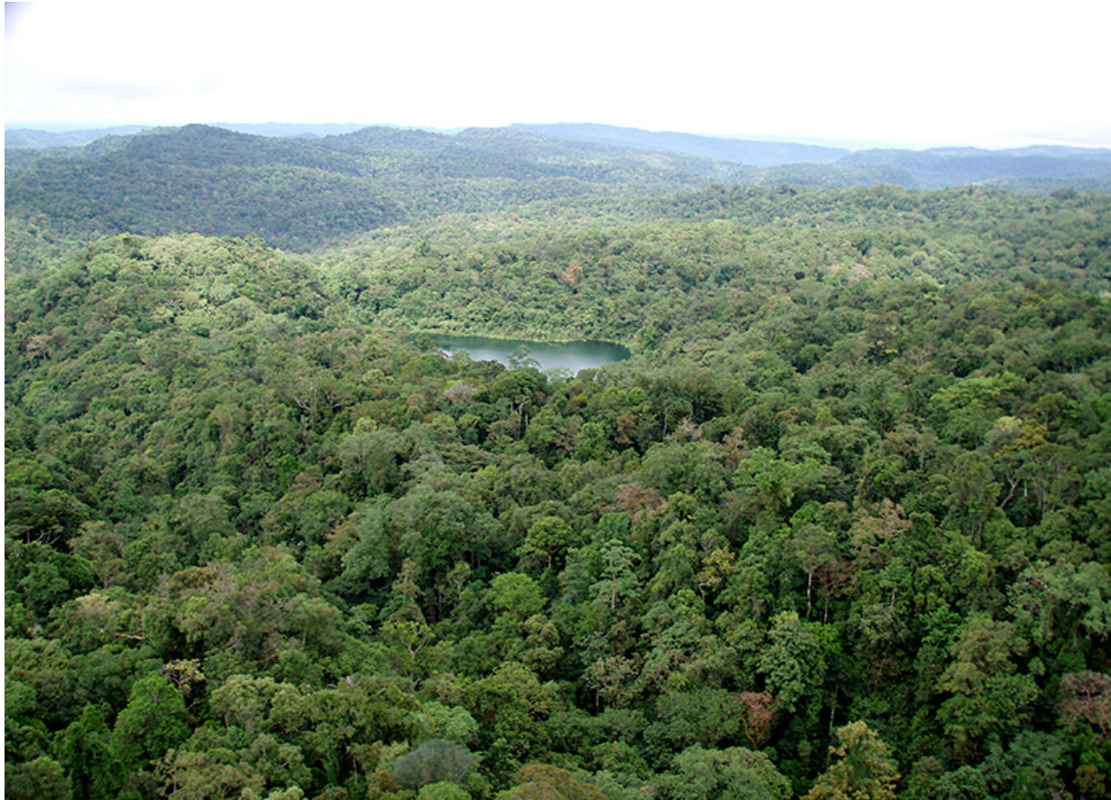
Fig. 3 : Typical topography and habitat in Juha area.